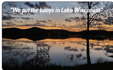
"We put the buoys in Lake Wisconsin"